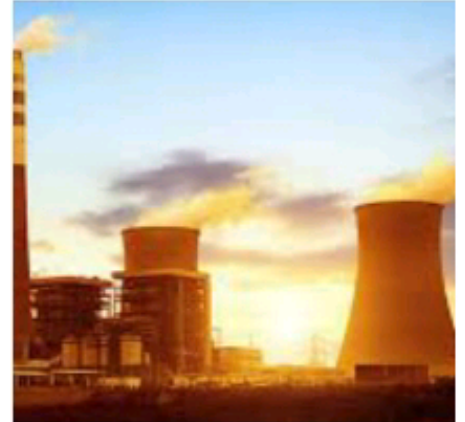
Nuclear Power Plants