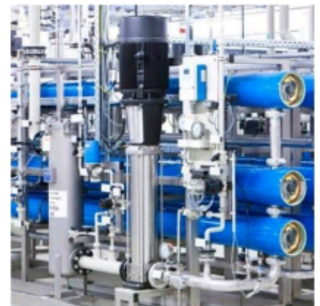
Water Treatment Plants