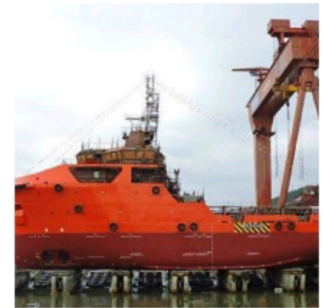
Offshore Engineering & Ship-building